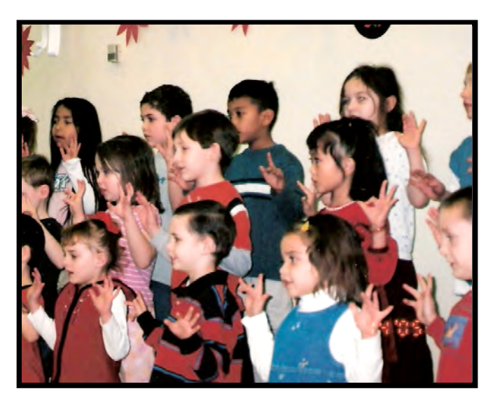
Our stars are twinkling as we sing and sign "Twinkle, Twinkle, Little Star."