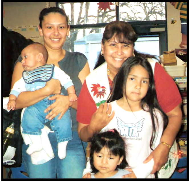
Time to visit back in the classroom with all the family and friends who came to watch.