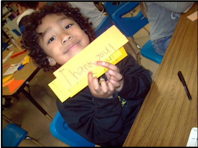
Do your best printing. (Children had practiced handwriting the word "you" earlier.)