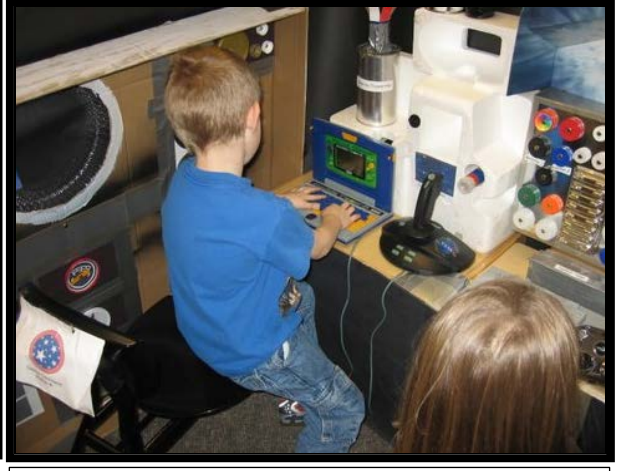
Space travelers translate messages from outer space.