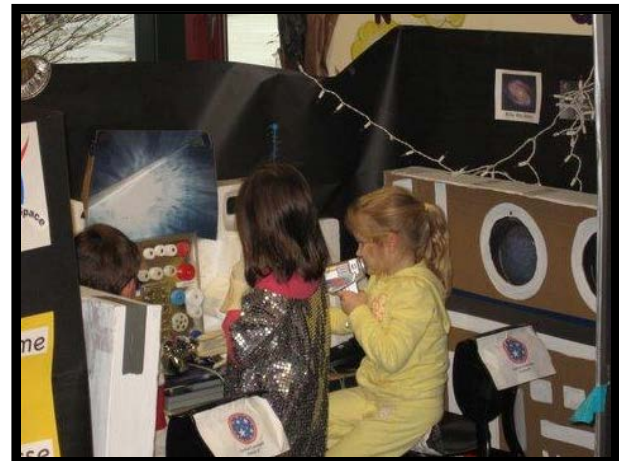
A long time ago, in a galaxy far, far away, kindergarten children traveled in space...

Station: Parent Volunteers Created All of the Amazing Props