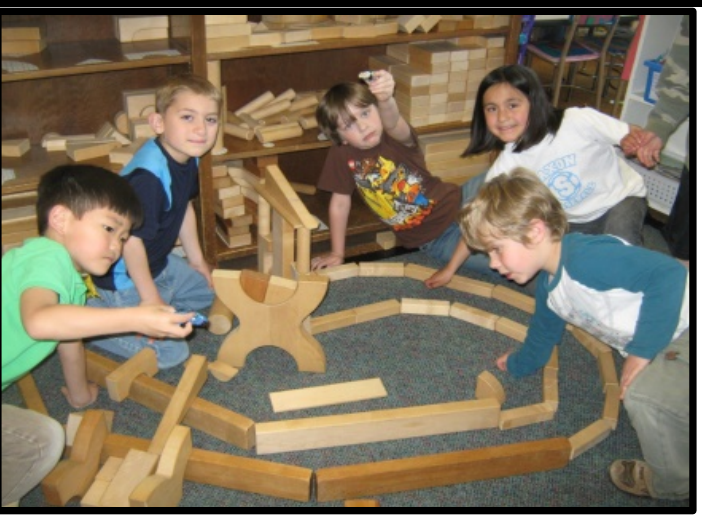
Imagination is more important than knowledge.