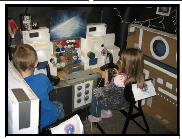
Pilot and co-pilot work together to navigate between the stars...

Consider the powerful vocabulary development and opportunity to develop collaborative conversations that occur during rich themed dramatic play.