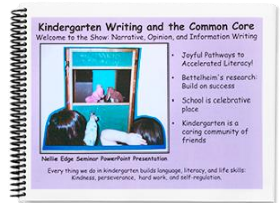
Your Writing Power Guide

Goal Setting and Celebration...music with autoharp and ukulele may continue.