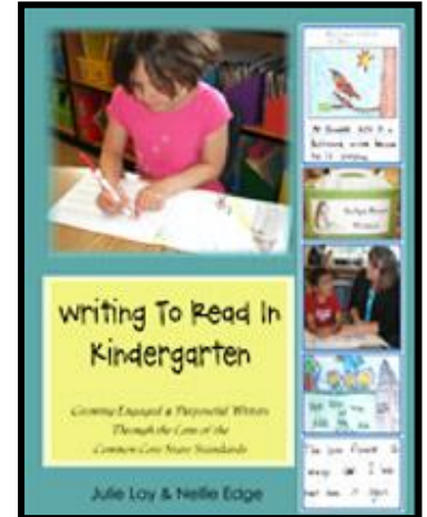
Handouts from Writing to Read in Kindergarten