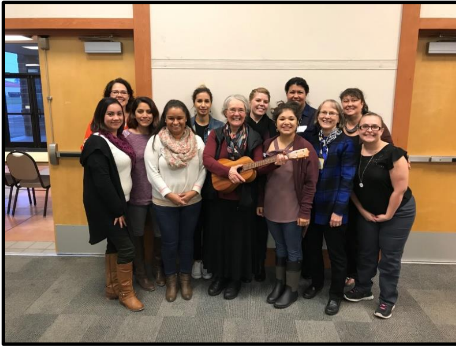
Marion & Polk Early Learning Hub Team

We appreciated the gracious feedback and the opportunity to return to the Spanish folk songs and Nellie Edge Read and Sing Books™ that I so dearly love to share.