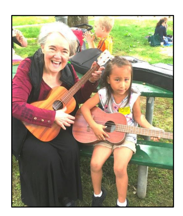
Music is magic in accelerating literacy, developing bonds of friendship, and creating magical memories.